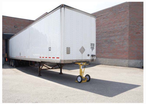
LDC's new EZ-Riser Trailer Stand The easiest, most convenient, and safest Trailer Stand on the market.

LDC has become a trusted name in managing dock and door safety, especially when it comes to preventing landing gear collapse, which has the potential to cause serious injury and damage to people and equipment. LDC's Trailer Stands are the best solution to increase work place safety.